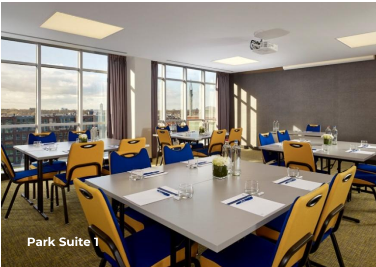
Park Suite 1