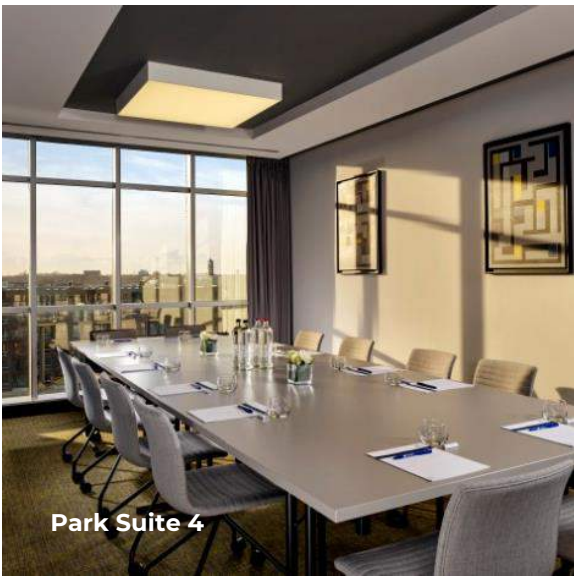
Park Suite 4