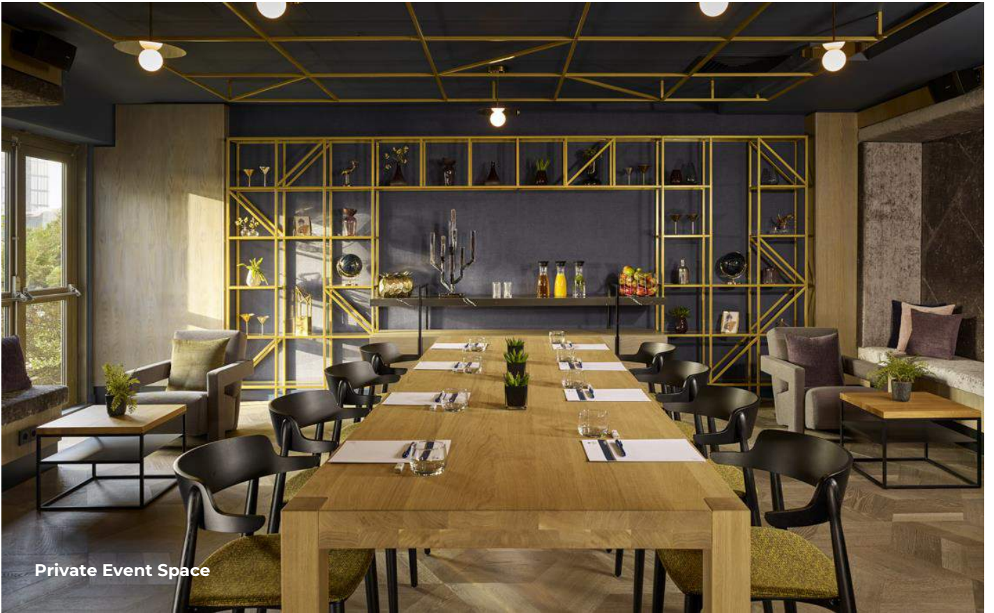
Private Event Space