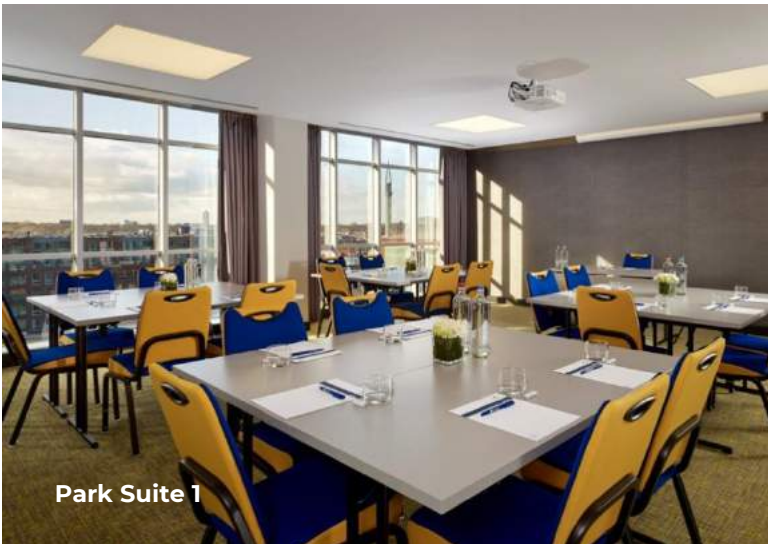
Park Suite 1